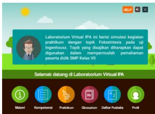
Figure 1. Home page menu